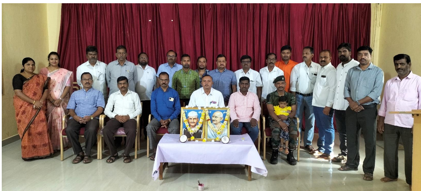
Staff Group Photo on the Occasion of Mahatma Gandhi & Lal Bahadur Shastri Jayanti